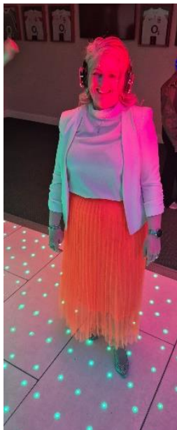
Neon evening and silent disco